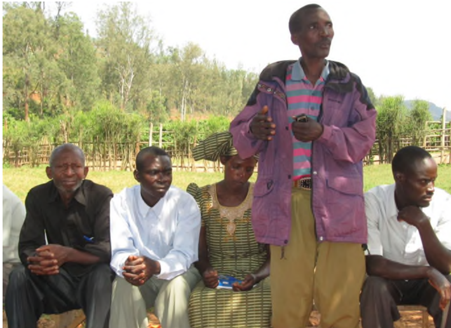
Stakeholder consultation in Rwanda

IWRM and SEA have much in common: they both include the integration of environmental and social considerations into multi-sectoral decisions; both emphasise the importance of participatory and consultative approaches to decision-making; both incorporate monitoring and evaluation of outcomes; both seek to broaden the perspectives of planners beyond immediate sectoral issues; and both emphasise that the outcome is a product, such as a policy of plan, as well as a process.