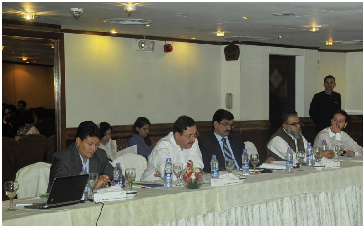
Stakeholder consultation on Accreditation Mechanism in Islamabad, September 2013.